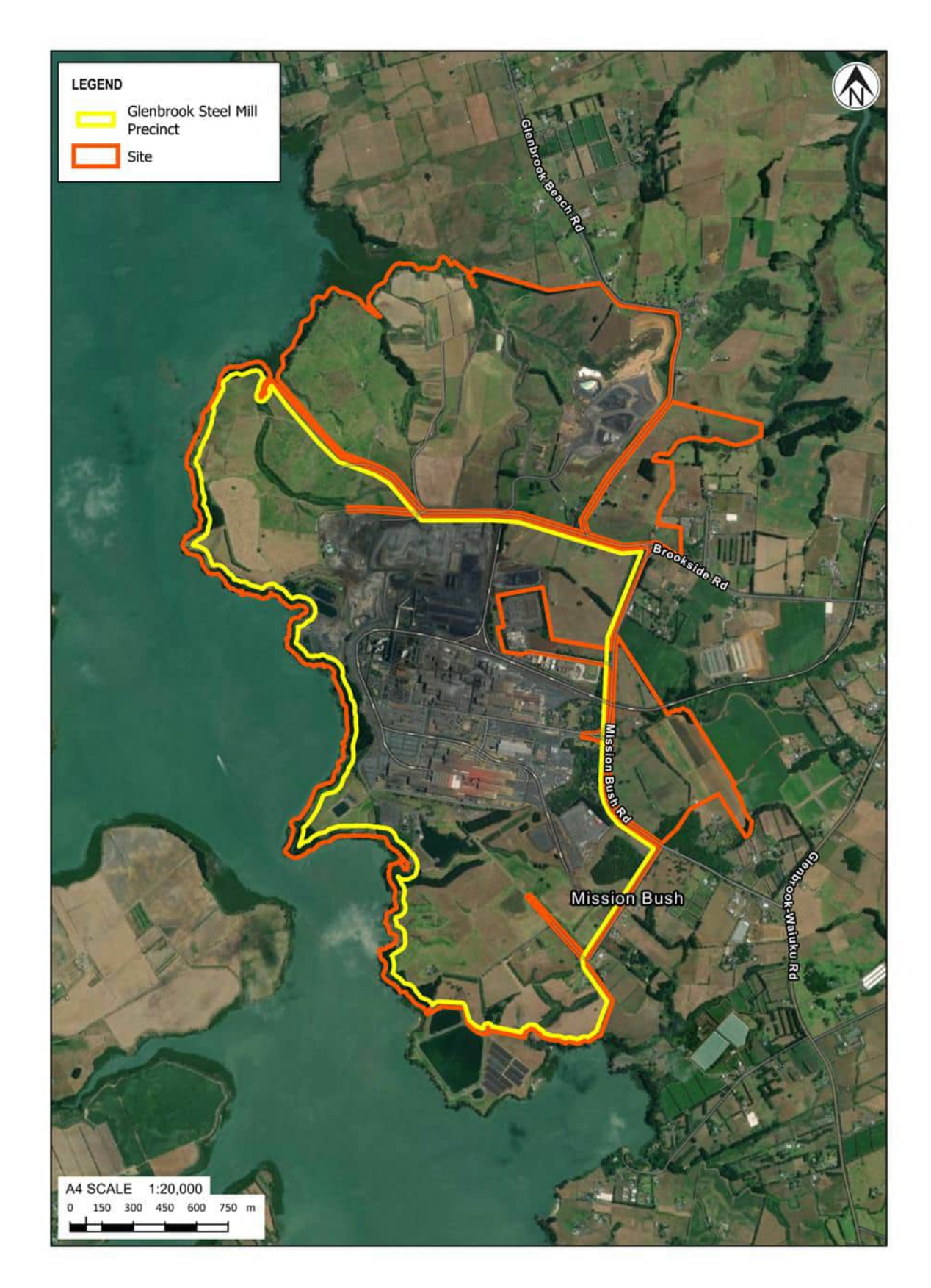
Figure 2.1: Glenbrook Steel Mill Site location. Base map sourced from Land Information New Zealand.