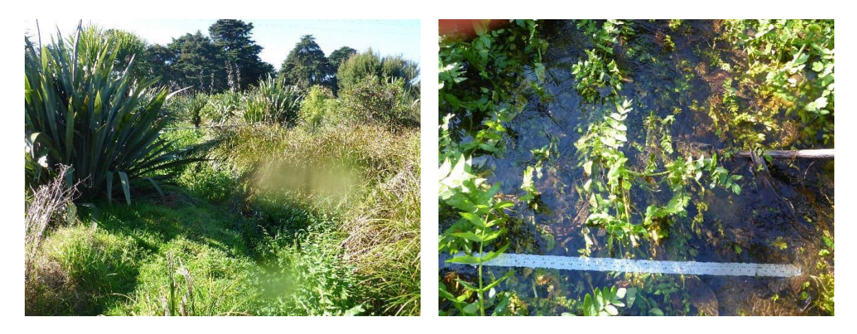
Photograph 5.7: Typical stream channel at Site 2, Ruakohua Stream.

The overall SEV score for Site 2 (including biodiversity values) was 0.46 (Appendix E Table 1). This moderate score is primarily due to the ecological benefits provided by the riparian planting that has been previously undertaken by NZ Steel. This SEV score was similar to the SEV score (0.47) calculated from the previous survey conducted in 2011 that followed an earlier version of the SEV (Rowe et al. , 2008) (Appendix F Table 1) which has been demonstrated to be comparative.