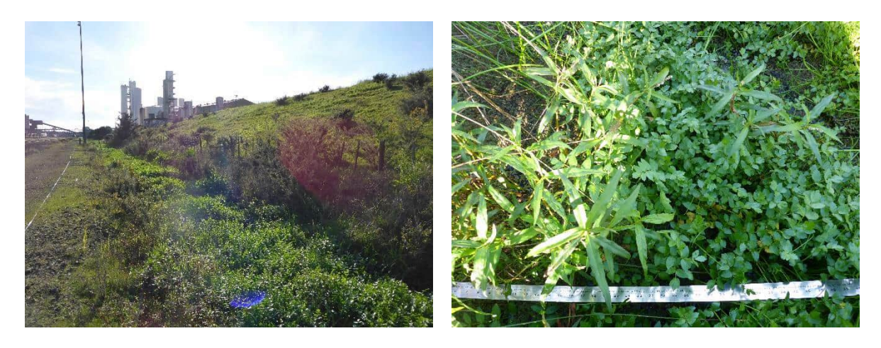
Photograph 5.1: Typical channel at Site C, North Drain.

The overall SEV score for Site C (including biodiversity values) was 0.19 (Appendix E Table 1). This score was lower than the SEV score (0.31) calculated from the survey conducted in 2012 (Appendix F Table 1). An increase in macrophyte coverage at Site C since 2012 is the likely cause of the decrease in SEV score.