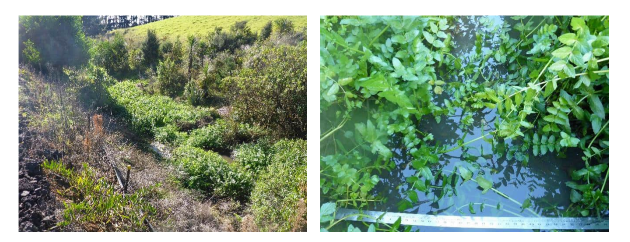
Photograph 5.3: Typical stream channel at Site A, Lower North Stream.