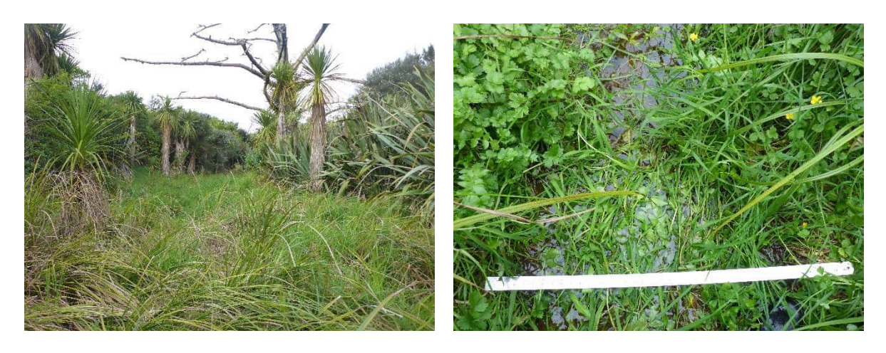
Photograph 5.5: Typical stream channel at the Kahawai Upstream site.

The overall SEV score (intermittent) for the Kahawai Upstream site (including biodiversity values) was 0.50 (Appendix E Table 1). This moderate score is primarily due to the ecological benefits provided by the riparian planting that has been previously undertaken by NZ Steel. This score was higher than the SEV score (0.39) calculated from the previous survey conducted in 2007 suggesting the ecological values of the site have increased (Appendix F Table 1). It should be noted that the 2007 survey used an earlier version of the SEV (Rowe et al. , 2006) which has been demonstrated to be comparable.