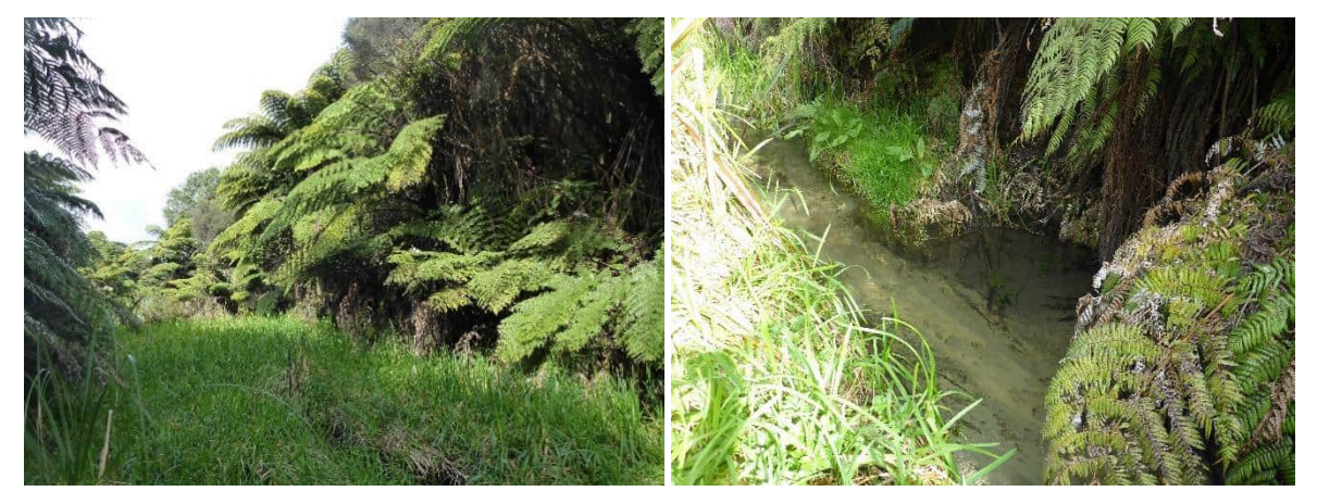
Photograph 5.4: Typical stream channel at Site 6, Lower North Stream.

The overall SEV score for Site 6 (including biodiversity values) was 0.67 (Appendix E Table 1). This 'moderate'<sup>34</sup> score was primarily due to the established native riparian vegetation that was planted approximately 22 years ago along this section of the Lower North Stream.