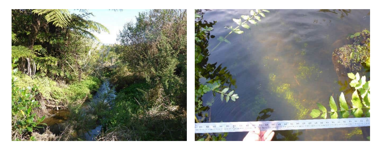
Photograph 5.8: Typical stream channel at Site 4, Ruakohua Stream.