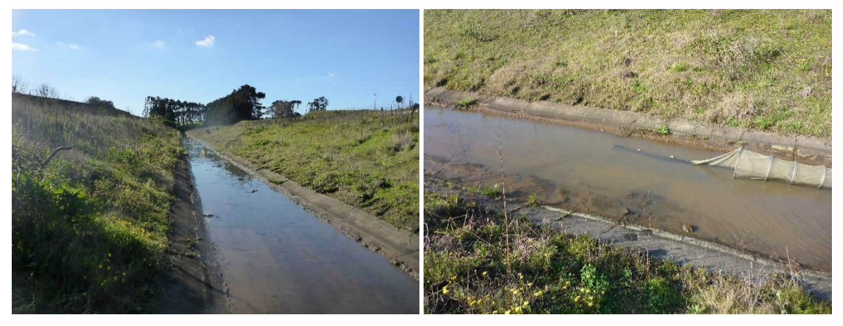
Photograph 5.2: Typical channel at Site B, North Drain (no flow from Dewatering Plant at time of photograph).

was present within the stream channel which is expected given the stream bed is completely lined with concrete. A thin layer of periphyton growth was present on the concrete. Habitat abundance and diversity was 'poor' with very little favourable habitat present. The overall SEV score for Site B (including biodiversity values) was 0.23 (Appendix F Table 1).