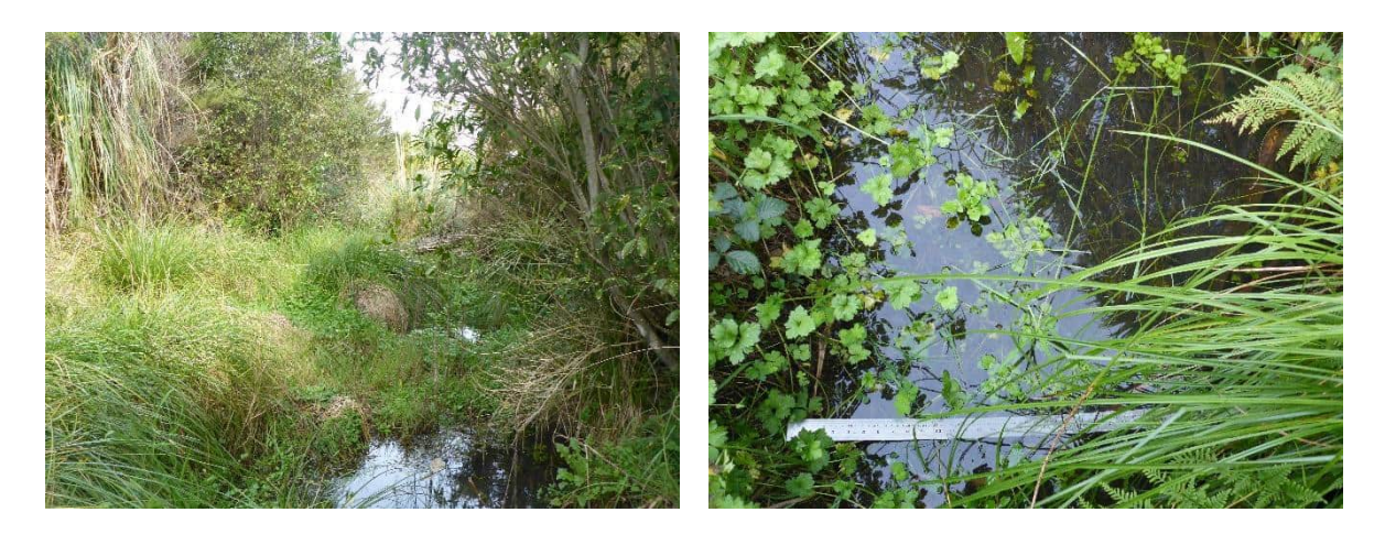
Photograph 5.6: Typical stream channel at Kahawai Downstream site.